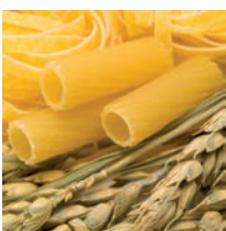
Food and Feed